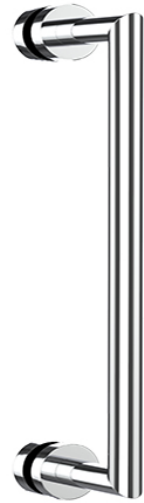
Large Rosette (Large 1 1/2")